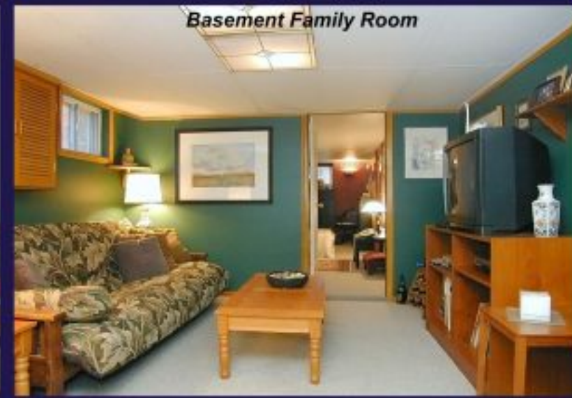
Basement Family Room