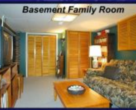
Basement Family Room