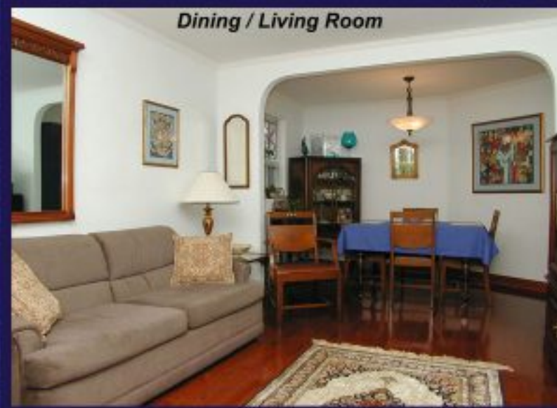
Dining / Living Room