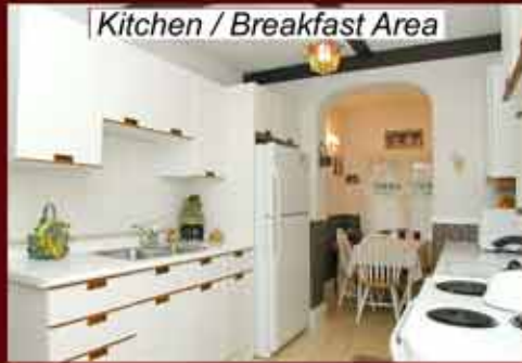
Kitchen / Breakfast Area