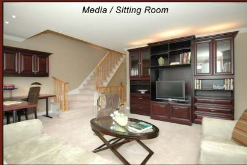
Media / Sitting Room