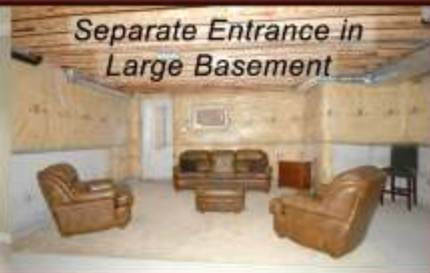
Separate Entrance in Large Basement