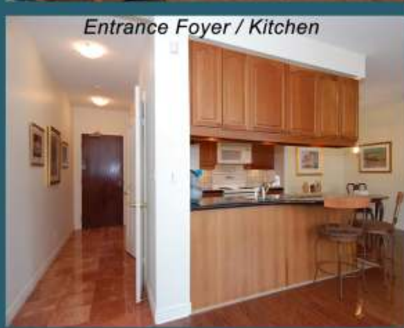
Entrance Foyer / Kitchen