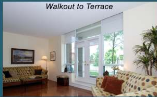
Walkout to Terrace