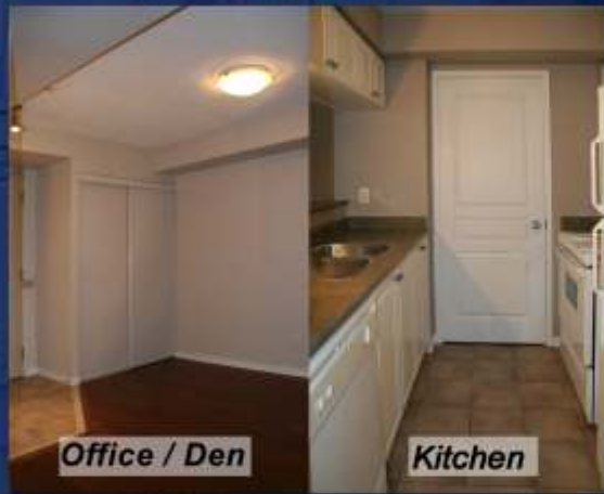
Office / Den